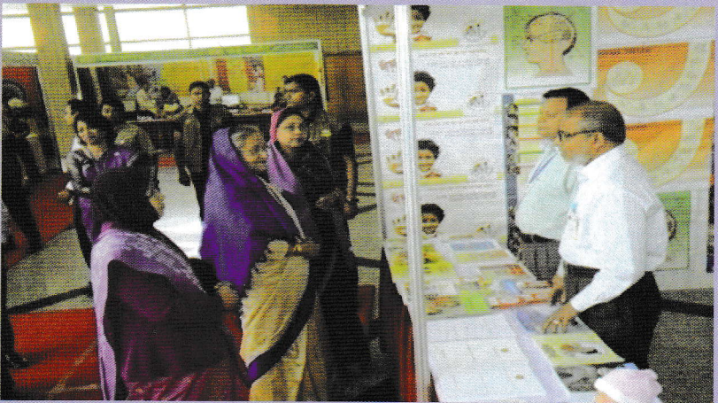
Hon'ble Prime Minister Sheikh Hasina visited a stall of ELCD project